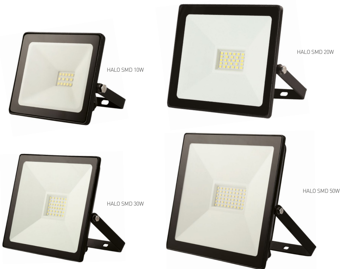
HALO SMD 10W